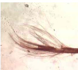
Pictured Left :- Plumose antenna of a non-biting midge. Extracted from a Daubenton's bat dropping.